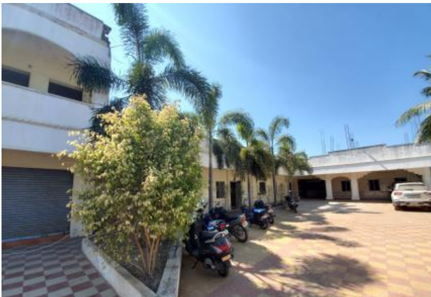
Christian Medical Center, Machilipatnam, India

Then recently, she came back to us with a large swelling occupying the whole of the left side of the face involving the cheek, maxilla and below the left eye. It was hard to touch and I did not like it. She had no pain though, which made it even more bad news. We spoke to her and her attendees and asked then to get a CT scan done. The reports were bad as expected. The mass had bored through her maxillary sinus and occupied the whole of the sinus on the left side and was working its way into the nasal cavity and the lower wall of the eye socket. This was suggestive of a possible carcinoma of the maxillary sinus. We had to get a biopsy study to confirm the same. It was hard to break the news but I had to. We talked to the family members who were all Hindus except for one of the sister's daughter who was a Christian. They had no money and could not afford the treatment. We got in touch with an oncologist whom I knew and he said that they could get some funding from the Chief Ministers Relief Fund towards her treatment. That was some relief but I could not stop the tears of the family. (Continued inside)