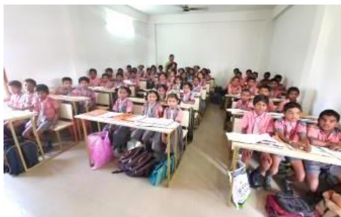
New Classroom in use in February