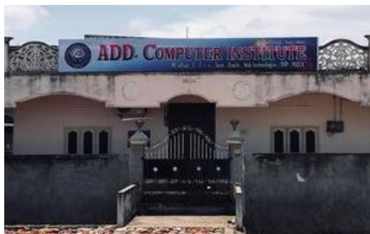
ADD. Computer Institute

I thank God for every opportunity I get to share the word of God to the students while talking with them. I trust that God will use the institution to change the lives of young people in all the days to come.