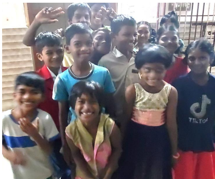
Some of the children from the Home

It is again that time of year when NACEA collects donations to buy Christmas gifts for the Children's Home residents, NACEA School children, village church children and widows as funds allow. Each child at the Children's Home receives a new set of clothes, books & a toy.