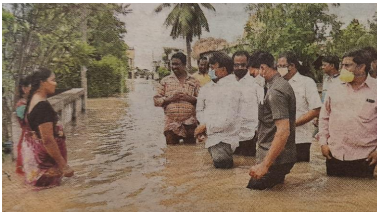
Villagers Checking on Neighbors

The preachers use this opportunity to show the love of Jesus to the Hindus and Muslims in the villages. This also strengthens the faith of those who have already chosen to follow Jesus.