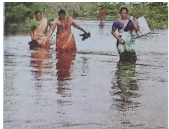
Wading to Market

Send your Gifts to: NACEA, P.O. Box 2309 Washington, IN 47501