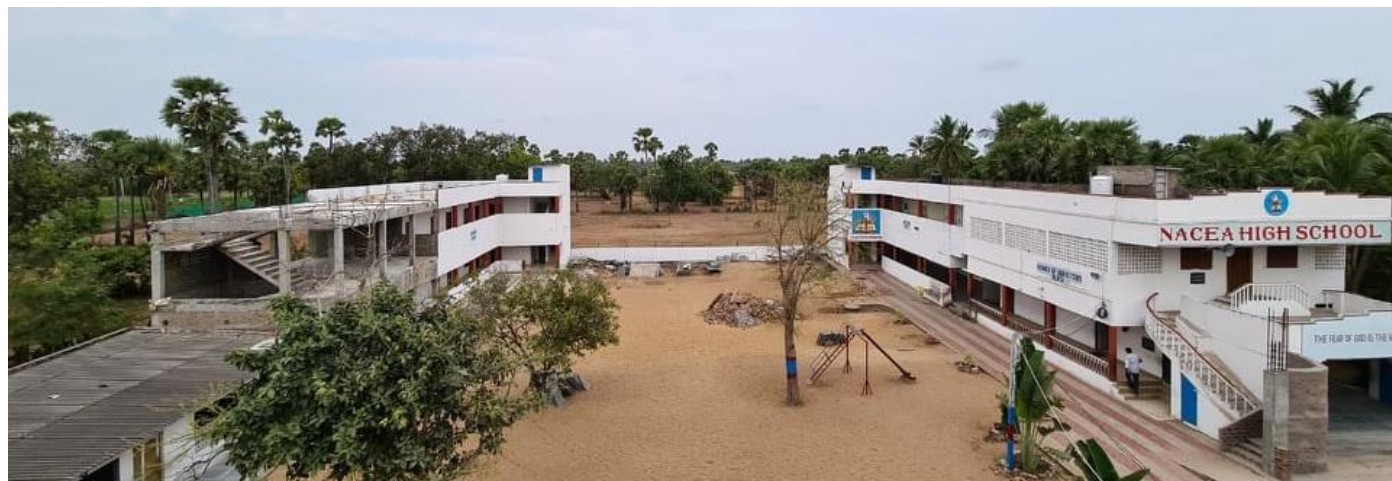
Overview of NACEA School from the School Library

NACEA School has been given the “ Golden School Award ” as one of the top 100 schools at national level for their performance in the INDIAN TALENT OLYMPIAD, a prestigious competitive exam conducted at national level. The in-charge teachers have also been presented with the “Inspiring Teacher” award for encouraging and inspiring their students in their respective subjects.