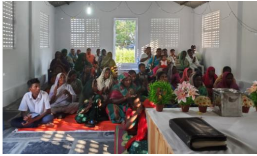
New Church at Muthrajupalem