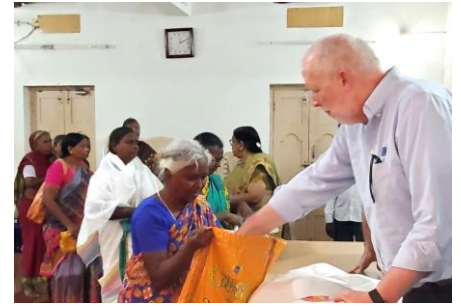
FAME Director distributing Food

For more information, visit us online at: http://naceamission.org/ and Facebook: nacea