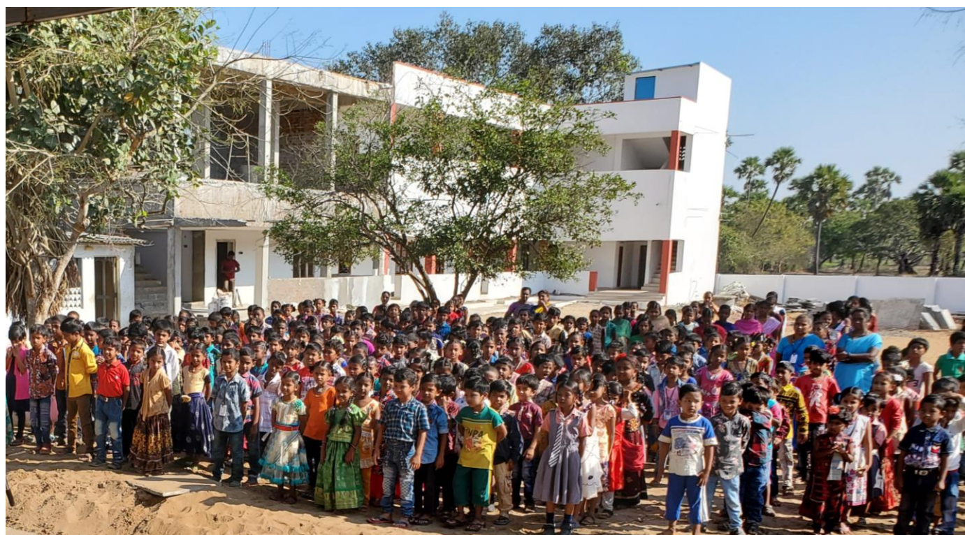
NACEA School Opening Program – Feb 2020

Short Term Mission Trips – a trip in February 2022 is in the early planning stage