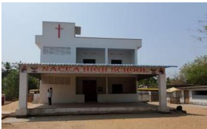
School Chapel, New Library & New Stage

The government has mandated that all schools be closed to in person classroom teaching due to the COVID19 pandemic until at least November. Since August the teachers have been conducting online classes using WhatsApp. Teachers make videos on topics from the lessons and post them. This only works for those students whose parents have a smart phone, so many are missing out on this instruction. No fees are being collected, so any donations to help pay the salaries of the teachers would be much appreciated. Please be praying that this pandemic will end soon so that the children can return to classes.