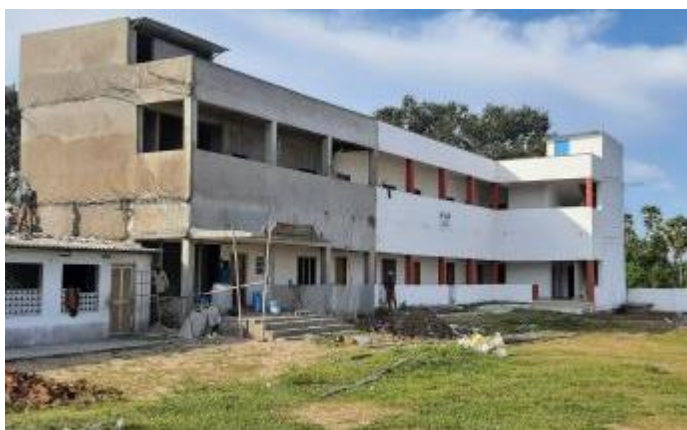
New Bethany Classroom Block nearing completion