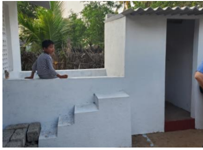
New Baptistry & Toilet