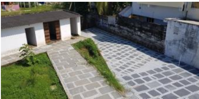
New paving stones at Rear COVID19 Exit to CMC

We consoled them and said that God could heal them if only they believed. And even if things did not turn out as we expect, He always has a plan and He could be trusted. We offered them prayers and we prayed with them. They lived close to a village in which NACEA has a church. So we asked the preacher to visit them and keep praying for them. The sister's daughter was a great help in introducing the prayer group to her. Last Sunday was the first day that the lady and her husband went to the church for the first time in their lives. Monday the blood work was done, Tuesday, tissue from the lesion was excised and the complete mass was excised. We are awaiting the result as I write about this event. Pray that everything will turn out good. And looking forward to seeing this lady and her family grow more in faith and accept Christ in the near future.