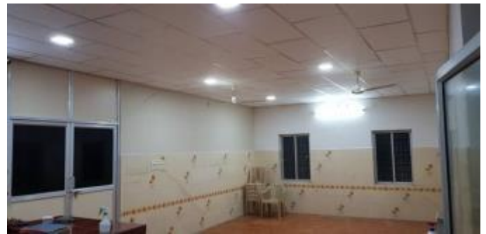
New drop ceiling in CMC Waiting Room

It's just heartbreaking to see countless number of lives lost to Covid19. And many more unable to receive the medical help they needed at the right time. Families broke and hope lost on all fronts for a lot of them. In spite of all this we can rest assured that Christ is in total control and at the end of all this we will see the grand victory.