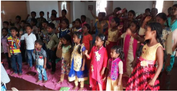
Singing at VBS