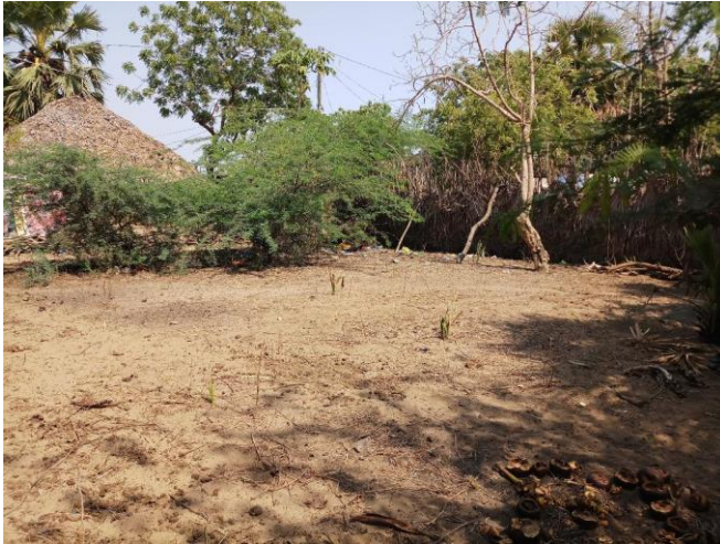
Church Building Site

A new Church building will soon be built in the village of Sanjeev Nagar on land that was recently dedicated for this purpose. No church building of any type currently exists in this village. The proposed church building will be the center of activities in the village. It will be used for worship, prayer, Bible Study, vocational training (sewing & candle making), and shelter in time of storm plus other community events. This building will allow all people to come together as one, no matter what their family caste. NACEA's goal is to build at least 4 new Churches every year. 5 villages are currently awaiting a new Church building. The cost of this church building will be $10,000.