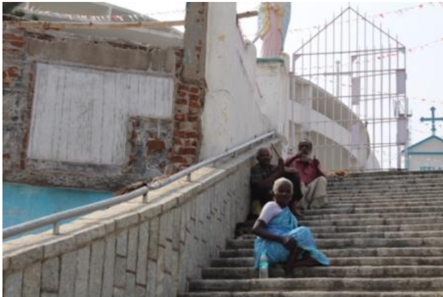
Steps to St. Thomas Mount in Chennai, India

When we were walking down the steps of St. Thomas Mount, there sat three people. Beggars are what we call them. I was told beforehand to ignore them when they call out to you, if you give them money they will keep asking for more. But while I was walking down the steps & they were calling out to me, my heart had tiny pins slipping into them; the guilt of turning someone in need away brought tears to my eyes. Nevertheless, I continued on. Then at the end of the stairs our group leader turned to me with money & said, "Give them each one & say God bless you." An overwhelming feeling of joy was radiating off of me as I walked back up those stairs, when they saw me coming they started praising me with thanks as I gave them the money, the woman took my hand & placed the other hand on her heart with a smile, the second man put his hands together & gave a bow with his head, the third man looked at me & said, "thank you blessed daughter of Mary." It was too late to say that, God already did bless me with a bittersweet moment like this. It's sad to think, some people are so poor, all they have is money. God taught me on this day that you can close your eyes to the things you don't want to see, but you can't close your heart to the things you don't want to feel. So ask yourself, who are the poor? Us? Or them?