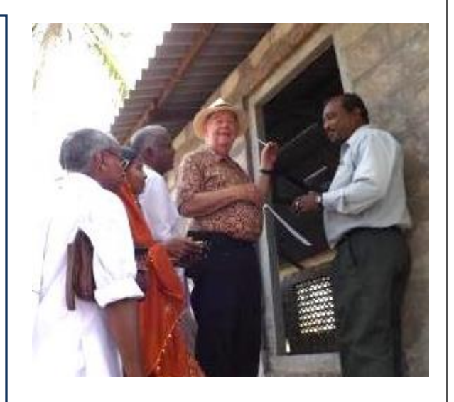
Charles dedicating Church in India