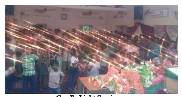
Candle Light Service

$10 will provide one child with a new clothing outfit. With an additional $10 the child will receive a toy plus some books.