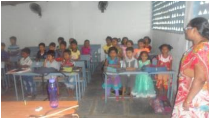
UKG-A Classroom with Teacher