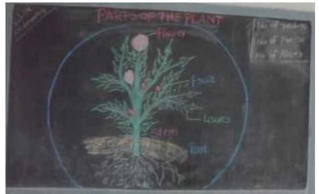
UKG-A Blackboard with Plant Parts