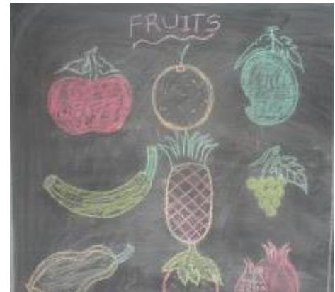
UKG-B Blackboard with Fruits