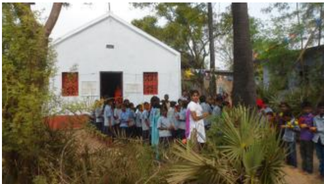
Welcome at Dodlapalem

NACEA currently has 45 preachers serving in the State of Andhra Pradesh and 6 preachers serving in the State of Tamil Nadu. NACEA has 46 active congregations and 39 completed church buildings in use. Five villages that have been reached for Christ are awaiting the construction of a church building.