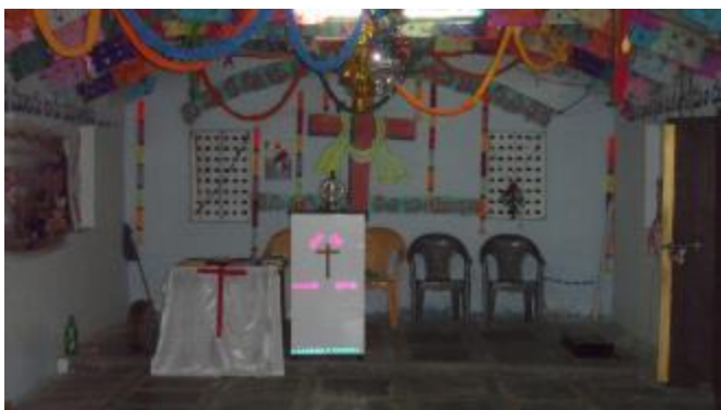
Inside of Yendakudura Church