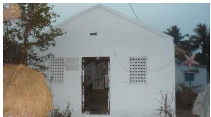
Outside of Yendakudura Church