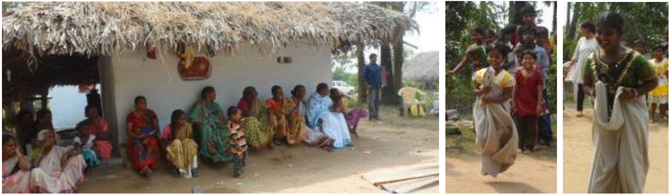
Ladies in Dodlapalem watching sack race

For more information, visit us online at: http://naceamission.org/ and Facebook: nacea