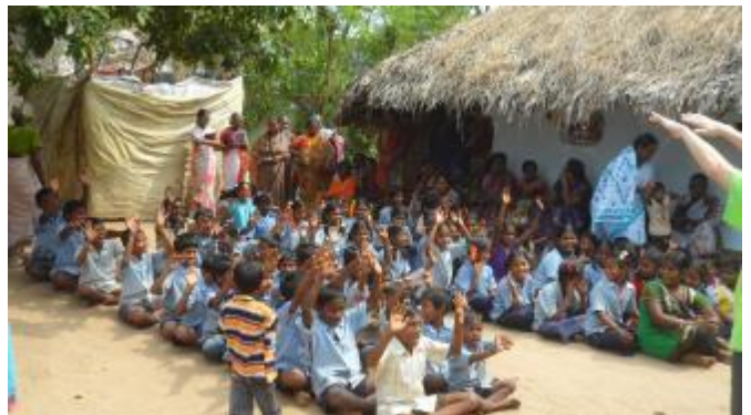
Youth Program at Dodlapalem