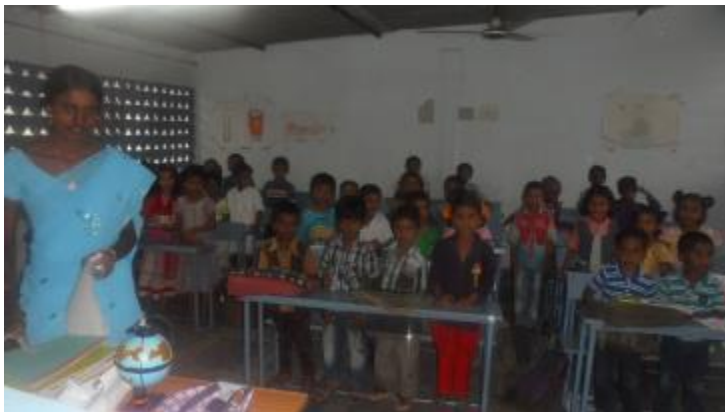
UKG-B Classroom with Teacher